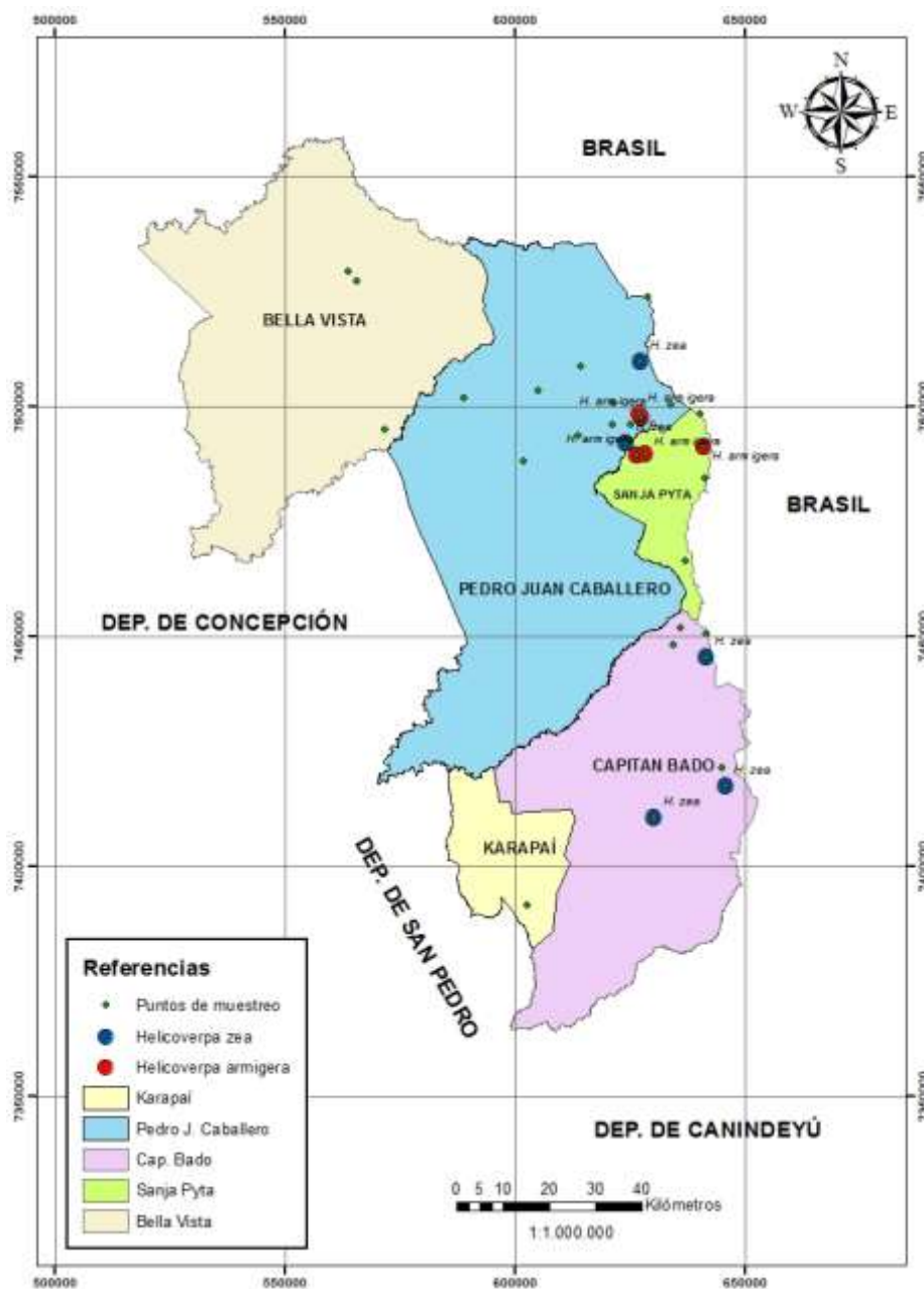
Figure 2. Detection of H. armigera and H. zea in soybean and maize crop 2016/2017 from districts of Amambay Department, Paraguay.